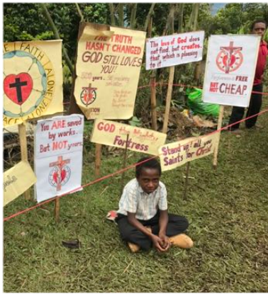
Boy at Sukutea Lutheran Church.